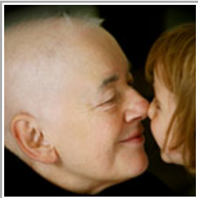
These 5 Signs Warn You That Cancer Is Starting Inside Your Body