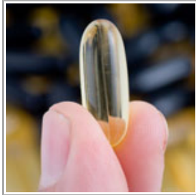
Rare Undersea Discovery Could Extend Your Life by 30 Years