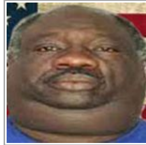
Online: Arrests, Driving Records, Contact Info.